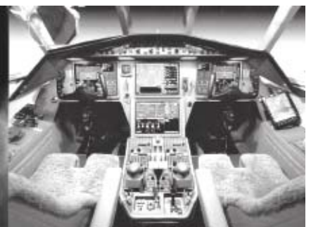
Falcon 2000LX Cockpit