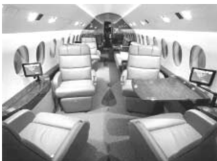
Falcon 2000LX Interior

Write to us today at tajair@tajhotels.com